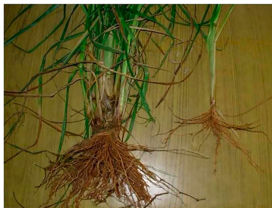
Figure 2. Comparison of the root systems of finger millet plants grown in Jharkhand state of India; SFMI methods on left, and conventional methods on right.

plants which are cultivated with SRI practices. These results were, however, unfortunately never published ( Figure 3 ).