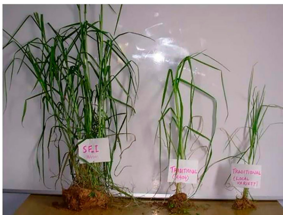
Figure 1. Finger millet plants grown with different methods in Jharkhand state of India, 2006 season. On left is a plant of improved variety (A404) grown with adapted SRI methods, including transplanting of young seedlings; in the centre is a plant of the same improved variety grown with farmers' usual broadcasting methods; on right is a local variety grown with these same traditional broadcasting methods.

Researchers at the state agricultural university in Andhra Pradesh (ANGRAU) had previously evaluated the effect that transplanting finger millet seedlings at a young age had on root growth. Two improved varieties were transplanted as seedlings when 10, 15, and 21 days old, respectively, and their roots were compared at 60 days after transplanting. Their results showed that finger millet plants have a root-growth response to the transplanting of young seedlings that parallels what has been observed with rice