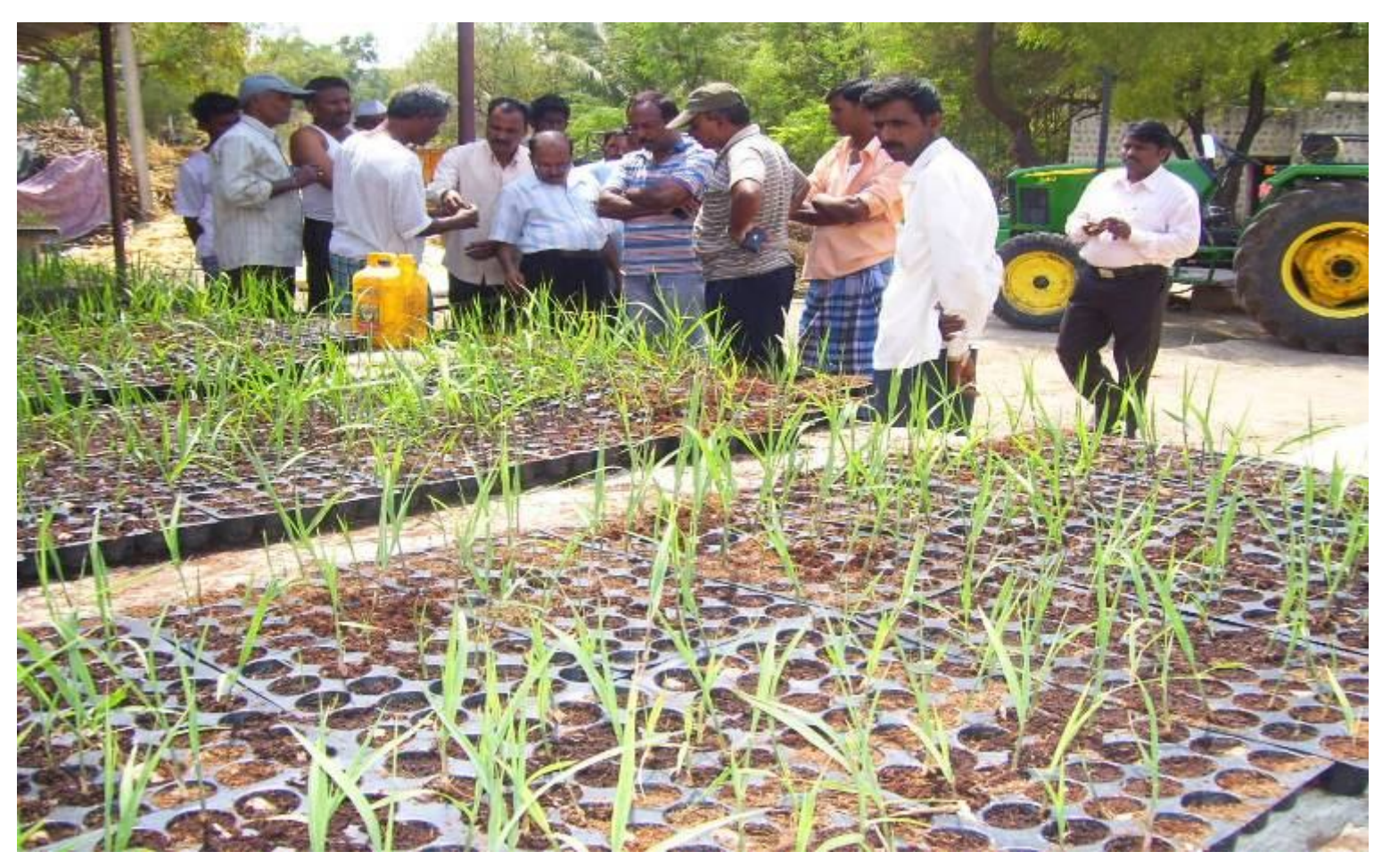
Open area Nursery Maintenance