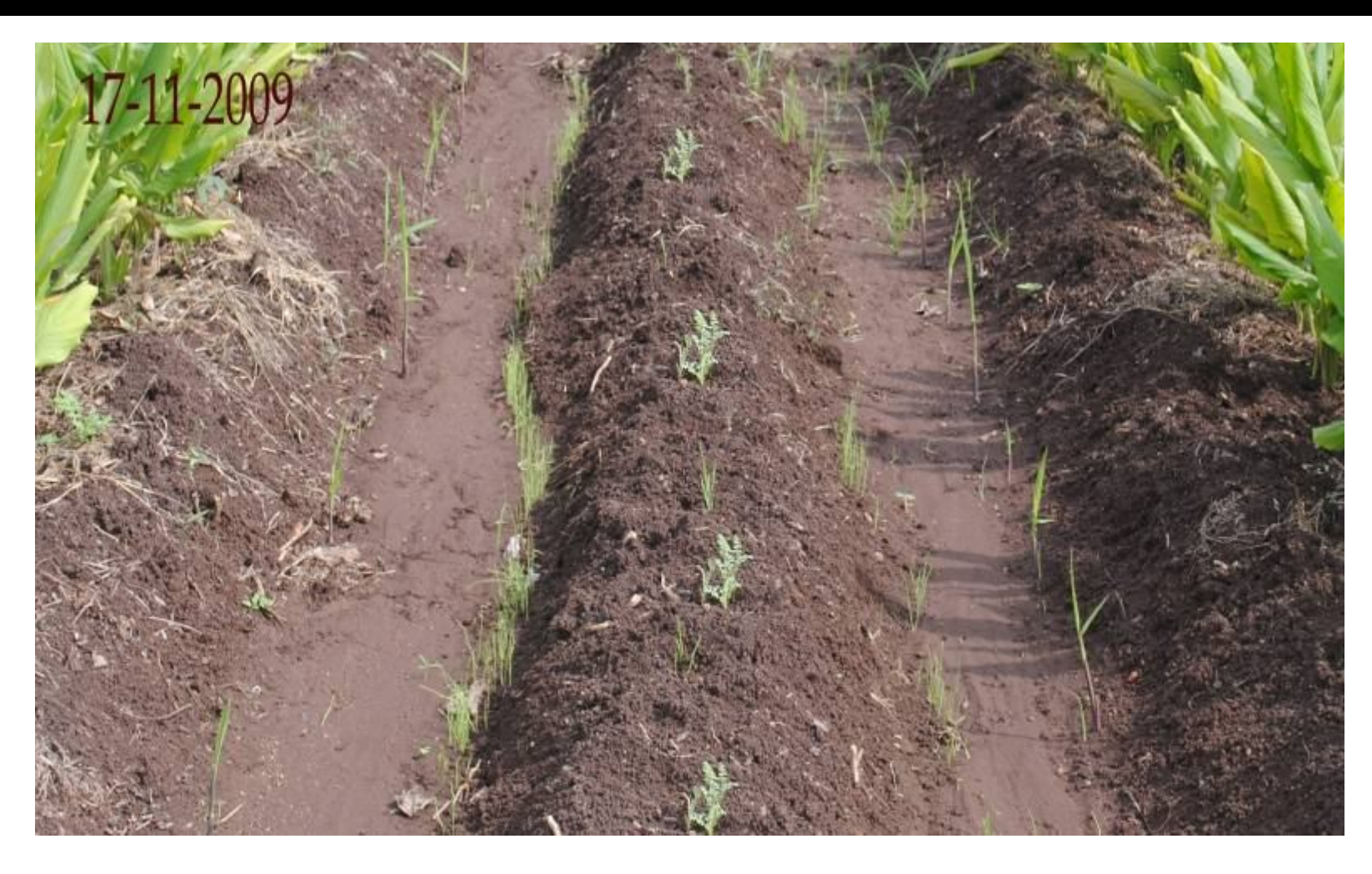
Vision Beyond Deliverables