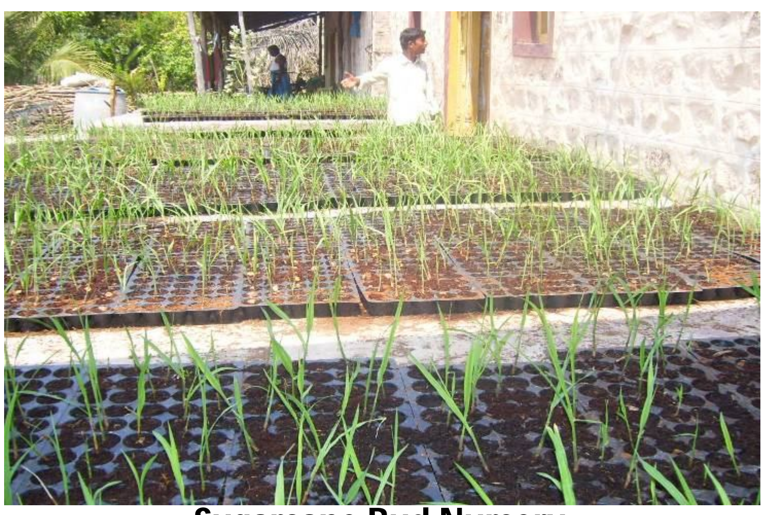
Sugarcane Bud Nursery