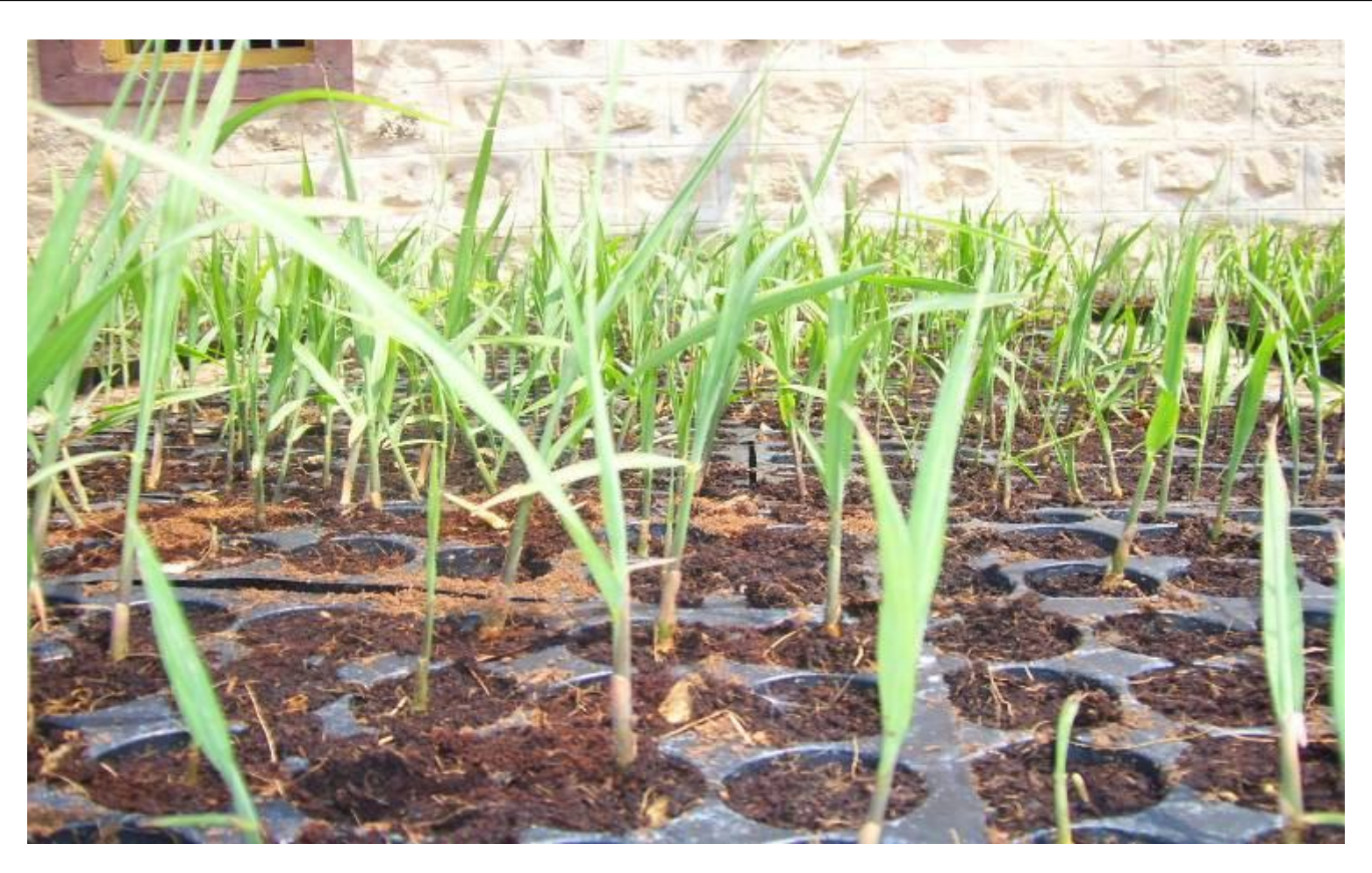
30th day Sugarcane Saplings